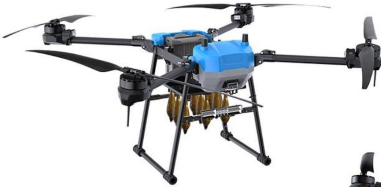
Multiple shells were thrown